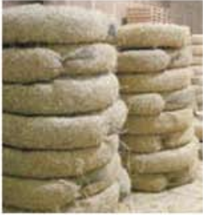
DIMENSIONS 9" X 25' Item# SC-RS925