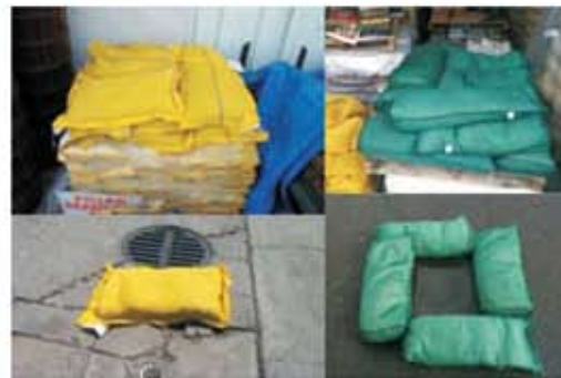
Item# FGB DIMENSIONS 14" x 26"