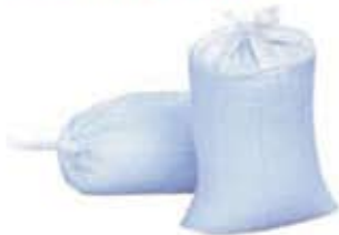
DIMENSIONS 14" x 26"